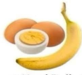
Banana + Hard Boiled Egg (carb + fat)